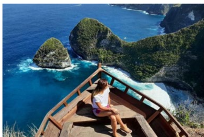
DAY 5: Bali - Nusa Penida Adventures